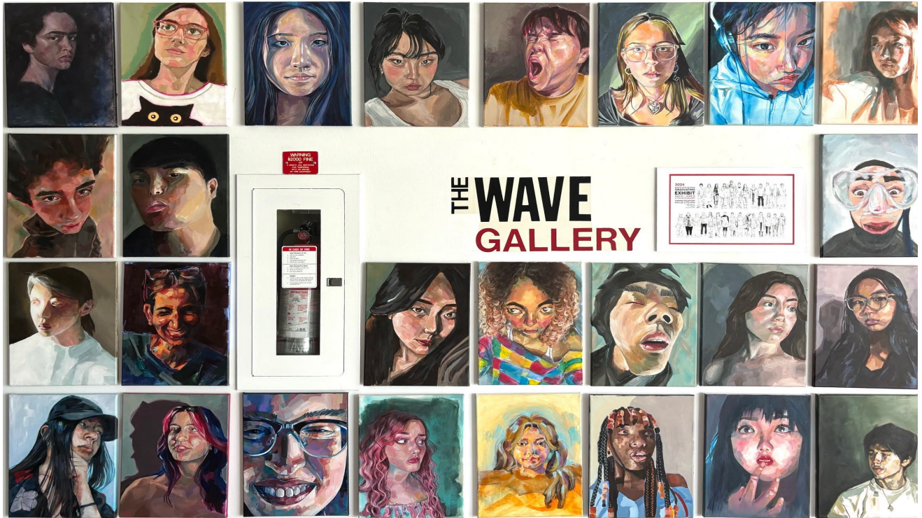
Grade 12 Visual Arts Majors