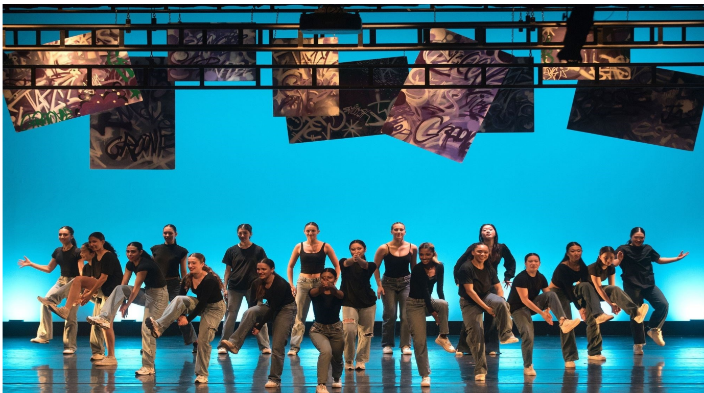
Grade 10 Majors