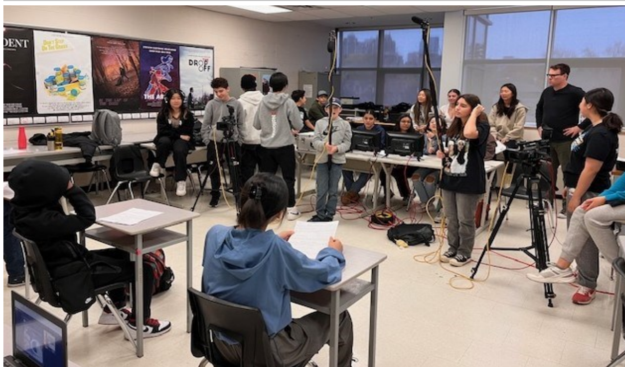
Grade 9's in a filming workshop semester 1