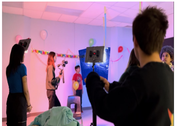
Grade 10's working on set Semester 2