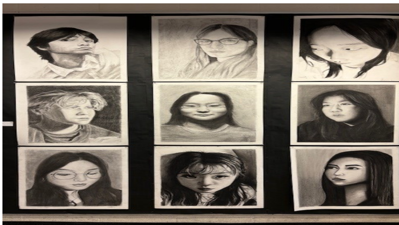
Grade 9 Visual Arts Majors