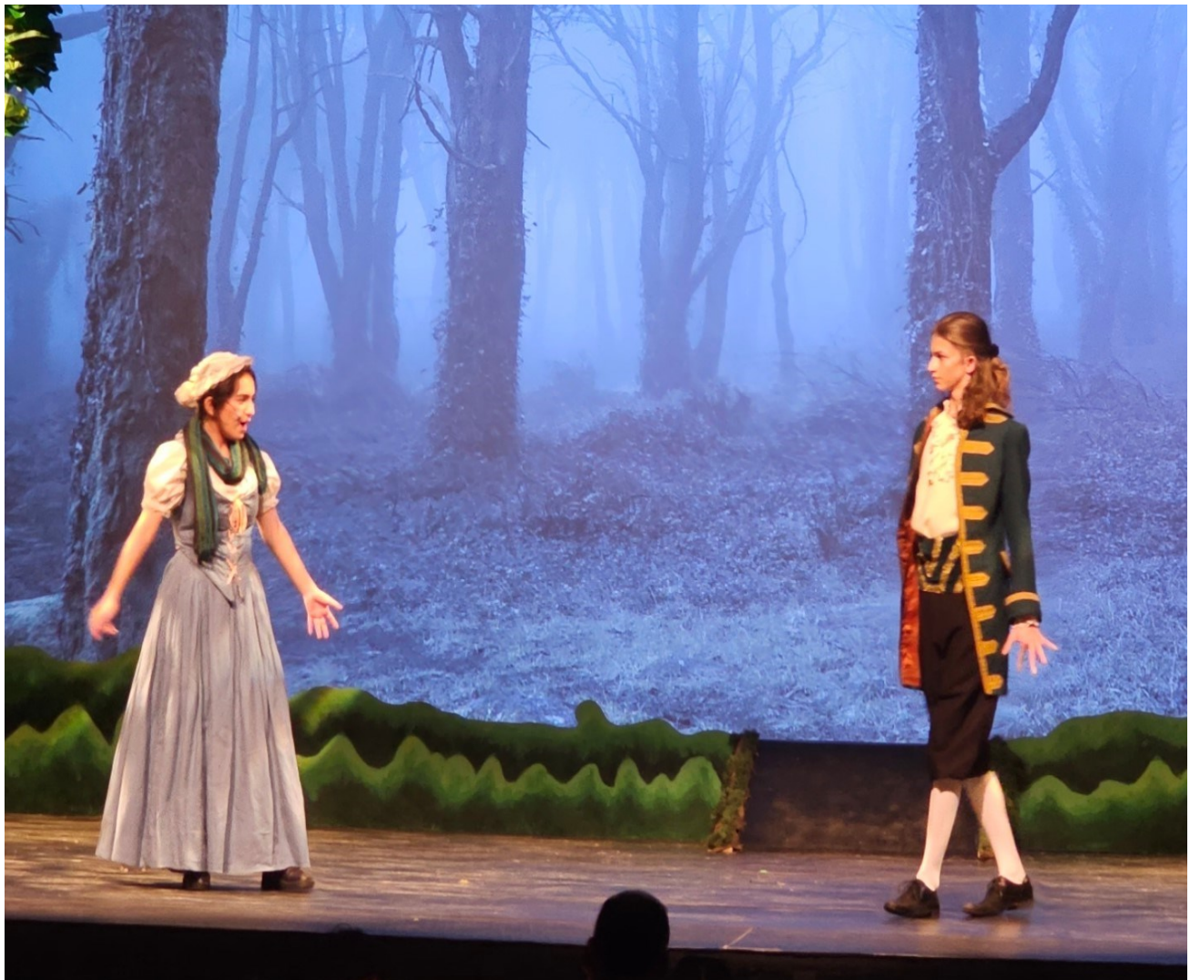
School Show—Into the Woods

The Grade 12 Drama Majors have had a very successful year of learning. They had the opportunity to go on many field trips and see some amazing theatre and work with inspiring guest artists. The class ended their final year with a sell out outstanding production of Alice in Wonderland. Bravo to our graduating class and best of luck in the future!