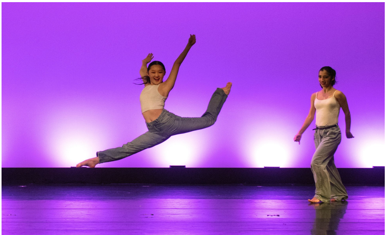
Grade 12 Majors