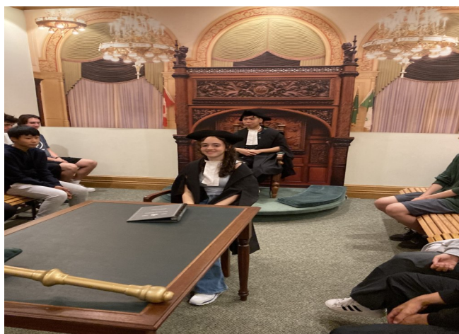
Grade 10 Civics– Ontario Legislation