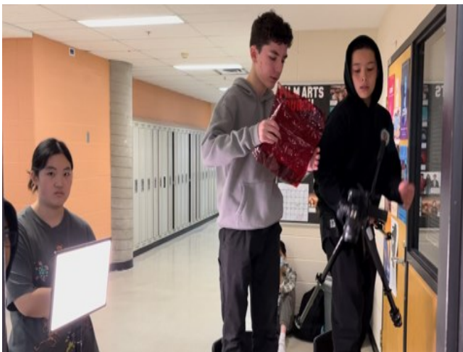
Grade 9's filming their culminating work semester 1