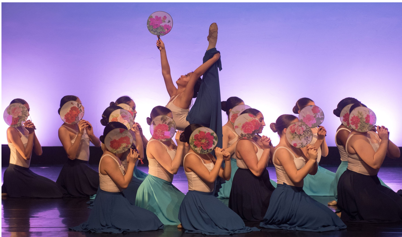
Grade 11 Majors