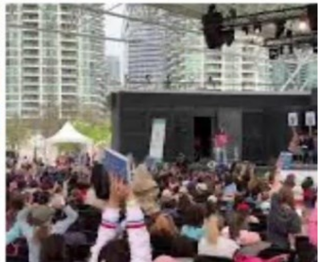
White Pine Reading Club enjoying the Festival of Authors at Harbourfront.