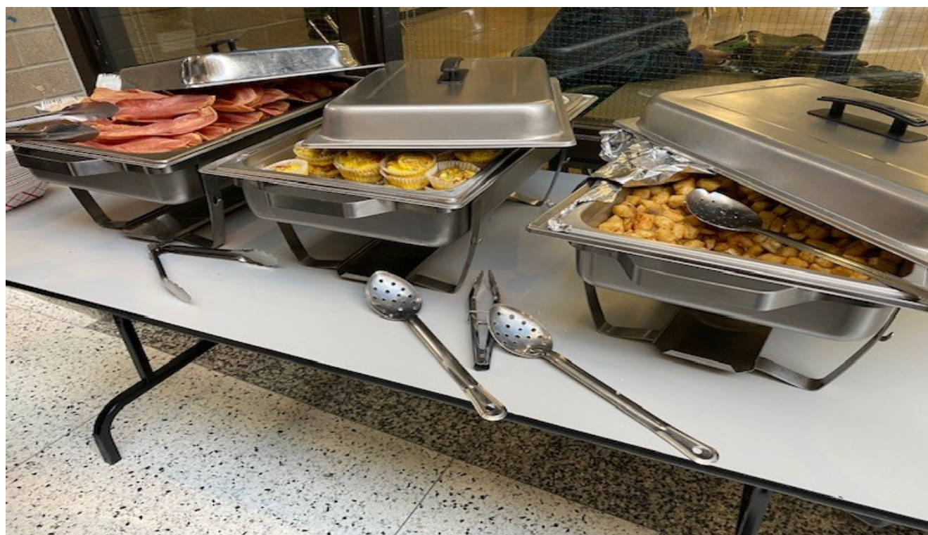
Culinary Students Preparing Breakfast