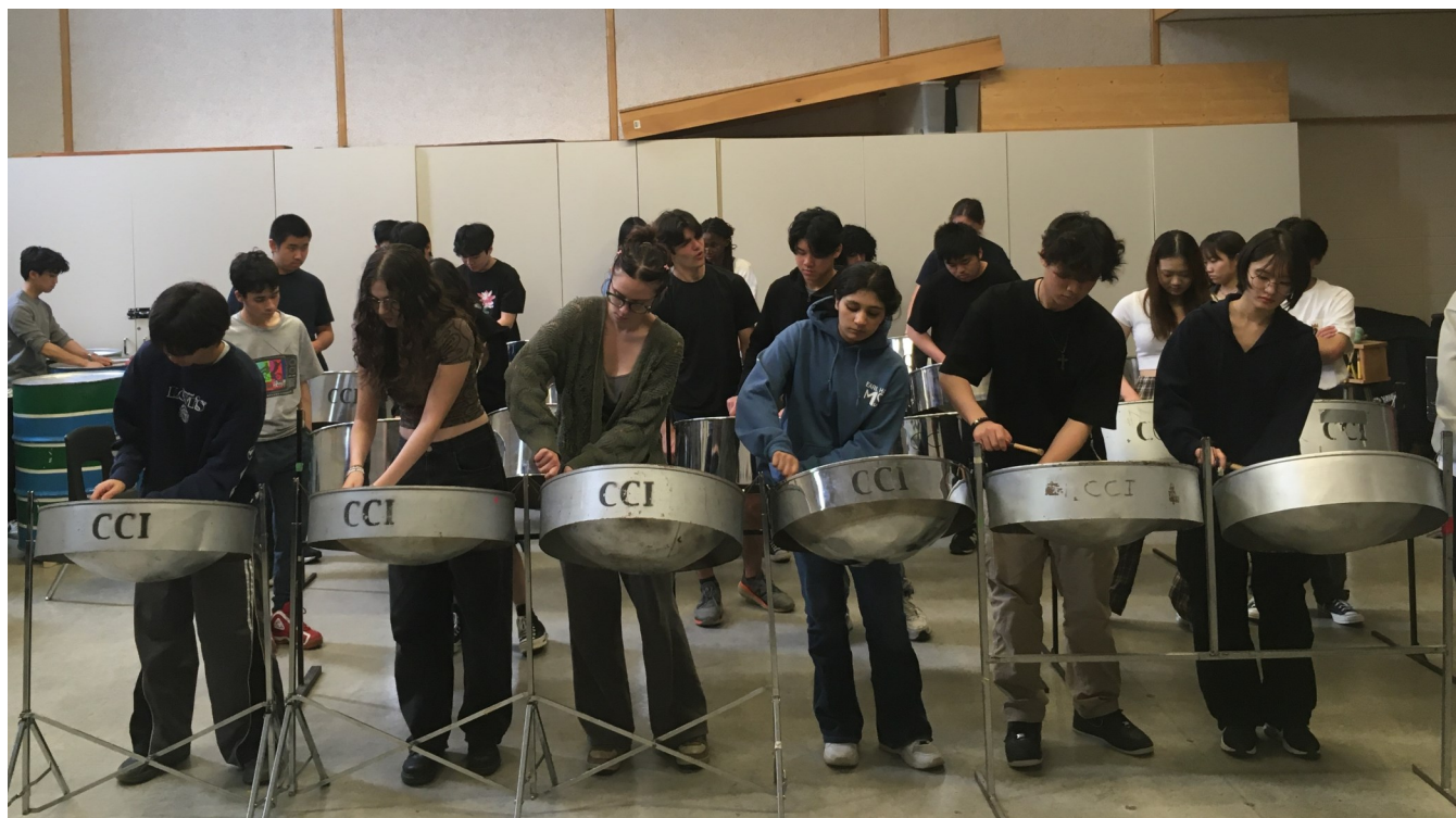
Exploring Performance Genres class practicing steel pan