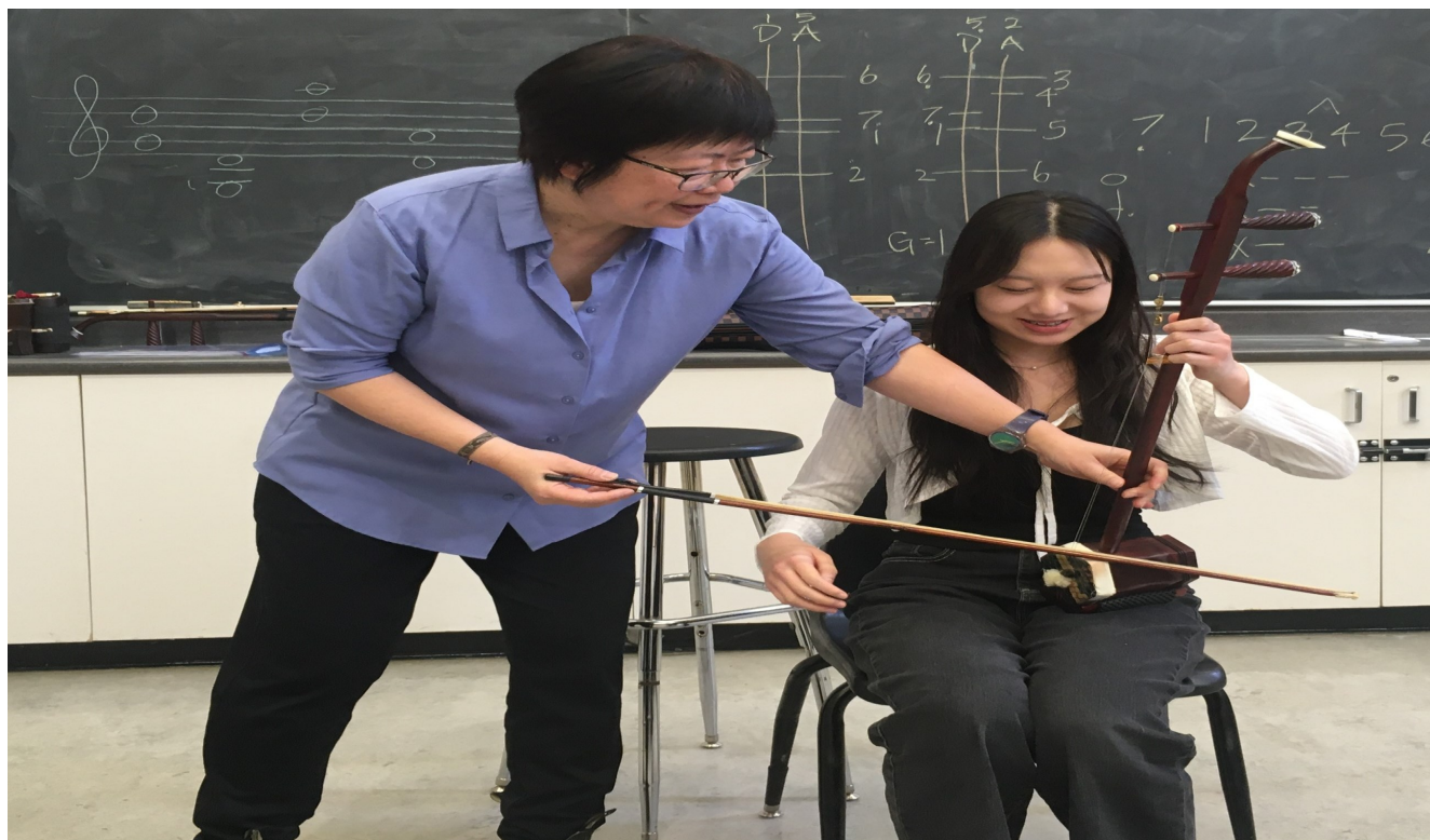
Toronto Chinese Orchestra teaching the erhu