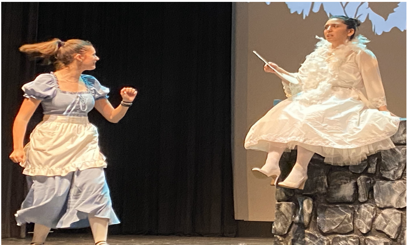
Grade 12 Drama Majors—Alice in Wonderland