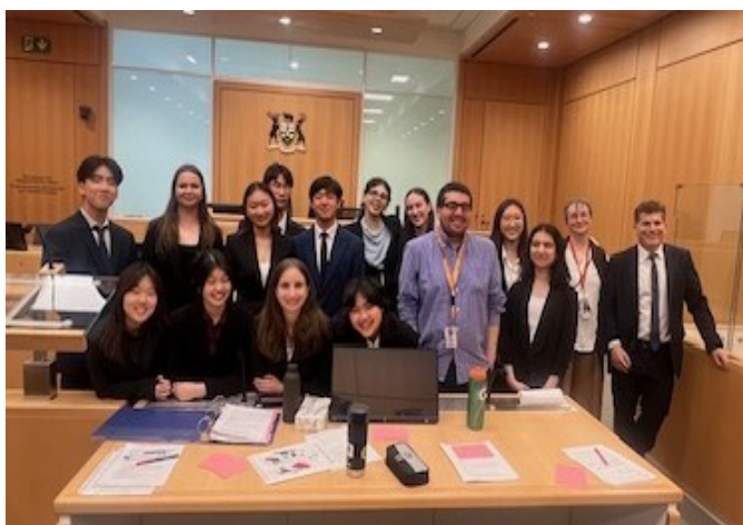
OJEN Mock Trial Competition

We wish everyone a great summer, congratulations to all our graduates, and we're looking forward to the 2024-2025 school year!