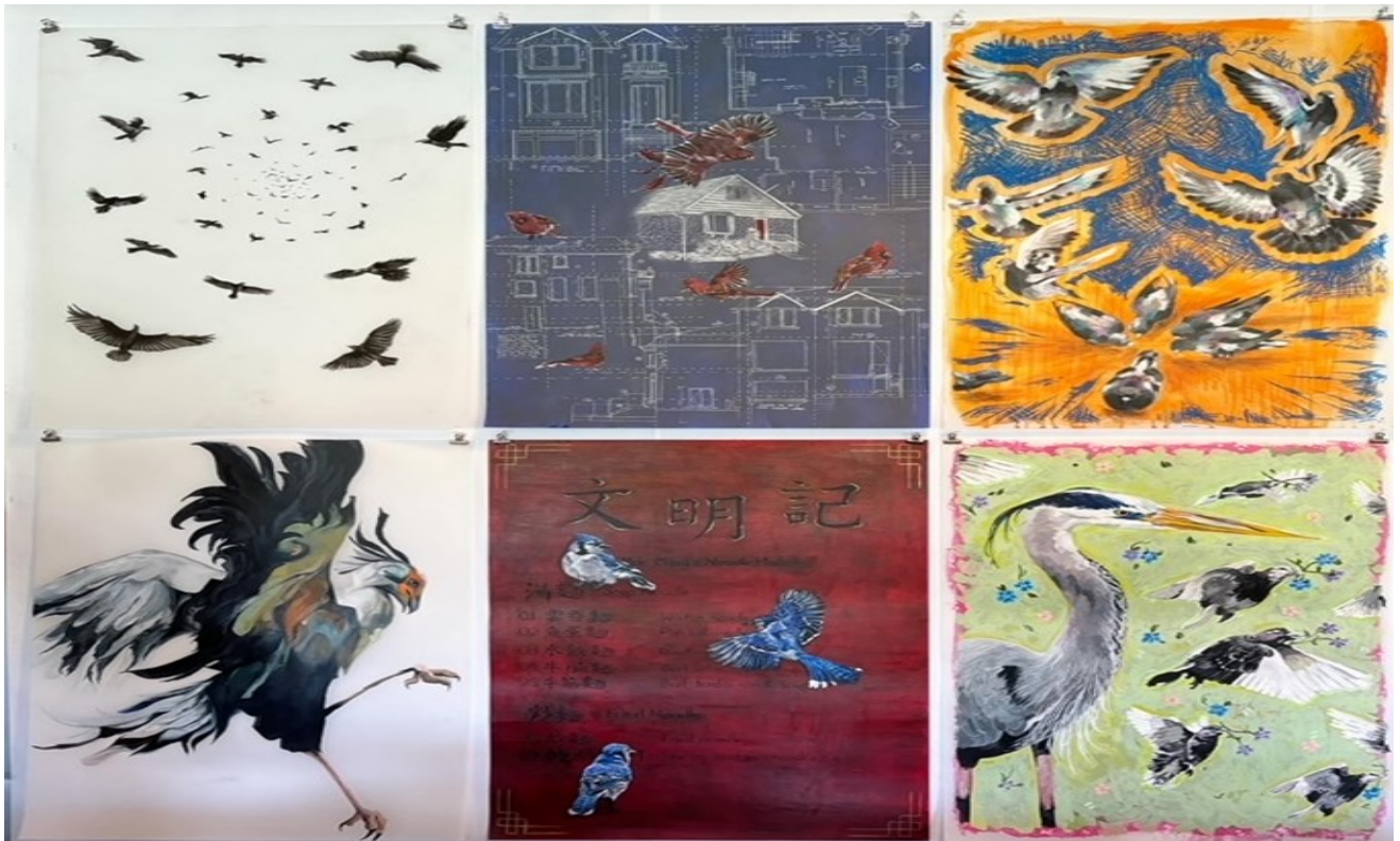
Grade 11 Visual Arts Majors