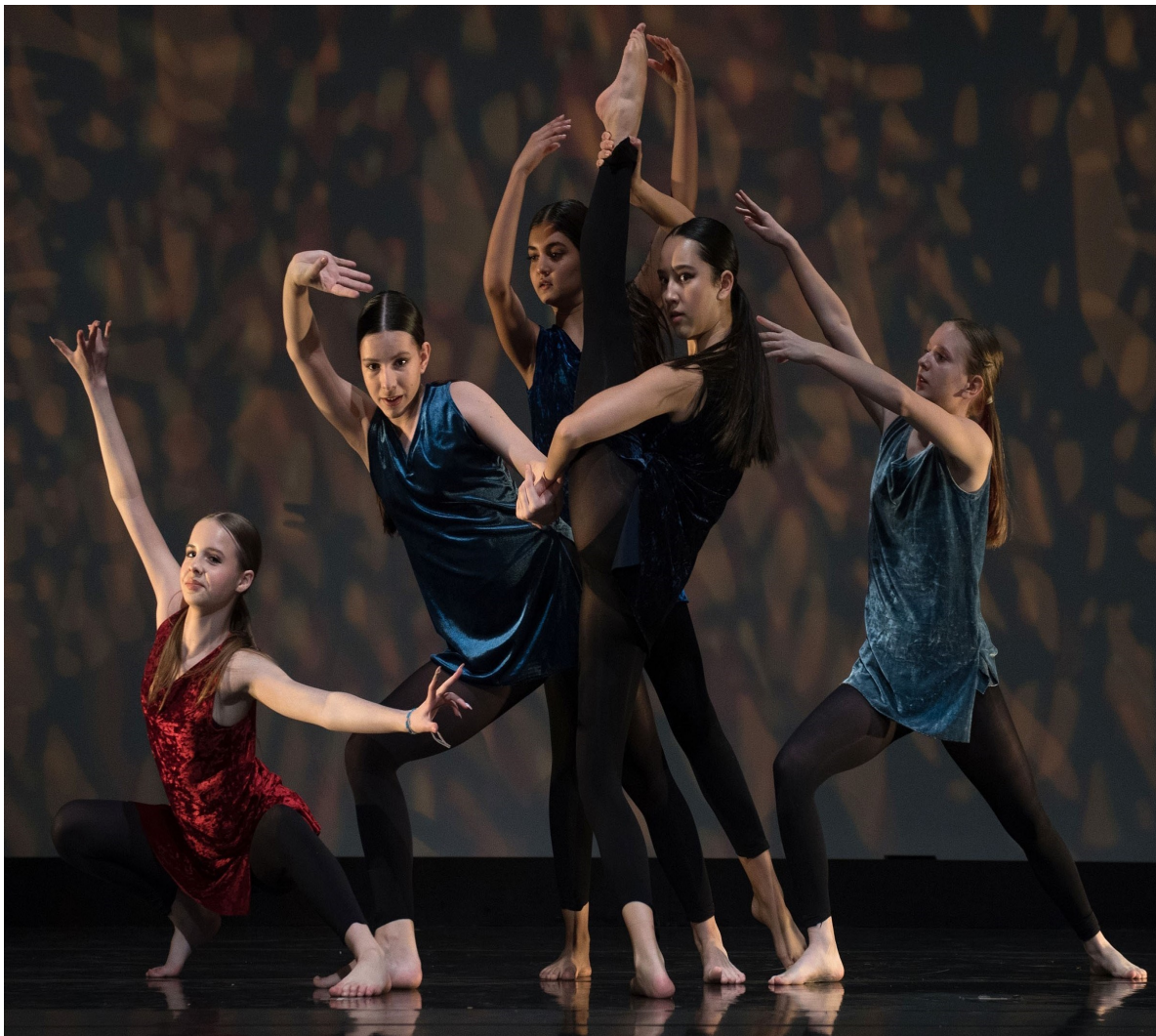
Grade 9 Majors